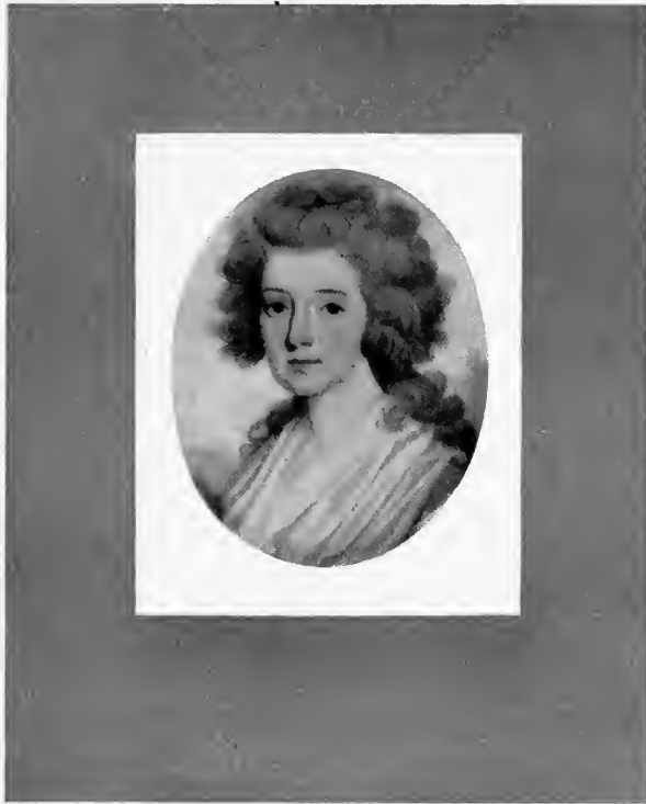
H.R.H. PRINCESS CHARLOTTE OF WALES (1796-1817) BY RICHARD COSWAY, R.A.